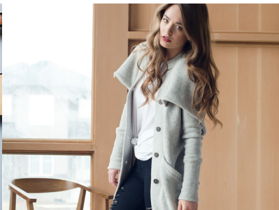
REBECCA KING FASHION HOUSE Saskatoon, SK