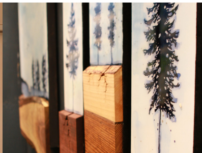
ROGUE GOAT Georgian Bluffs, ON